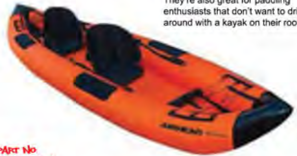
PART No A50-AHTK-2

Inflatable kayaks are perfect for camping, vacationing, exploring remote areas, and cruising yachts. They're also great for paddling enthusiasts that don't want to drive around with a kayak on their rooftop.