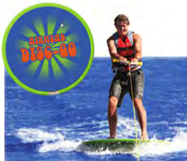
PART No A50-AHDG-01