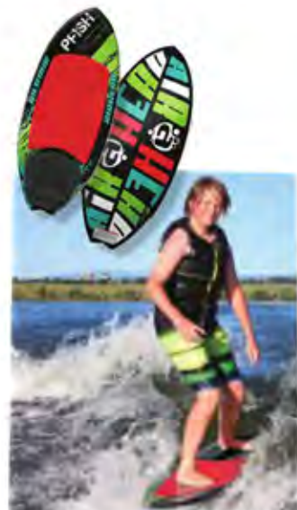
PART No A50-AHWS-F02