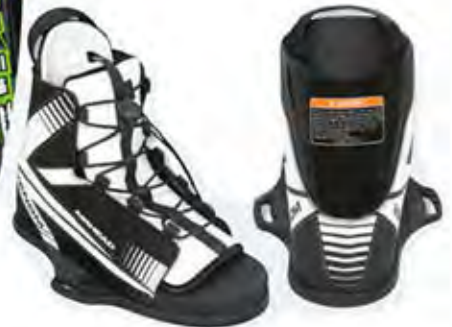
PART No A50-AHW-5050-22