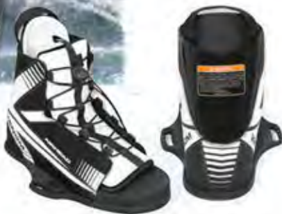
PART No A50-AHW-2020-21