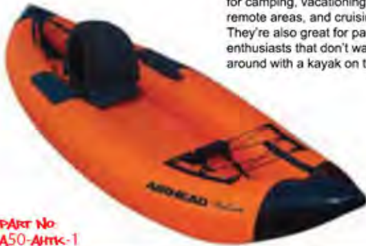
PART No A50-AHTK-1

Enjoying water sports just got easier! Inflatable kayaks are perfect for camping, vacationing, exploring remote areas, and cruising yachts. They're also great for paddling enthusiasts that don't want to drive around with a kayak on their rooftop.